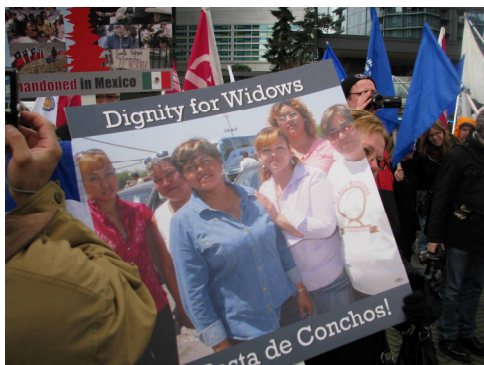
Participants remembered Pasta de Conchos widows.

Napoleon Gomez, exiled leader of Mexico's Los Mineros miners' union, spoke in Vancouver to remember the fifth anniversary of the explosion at Grupo Mexico's Pasta de Conchos coal mine, where 65 workers died. The government must recover the bodies of 63 miners still buried, provide adequate compensation for surviving families and hold accountable those responsible, Gomez said. Gomez has been in exile in Canada since 2006 because he called the mine explosion "industrial homicide" and criticized Grupo Mexico and the Mexican government. In retaliation, rather than prosecuting those responsible, the Mexican government targeted Gomez, heightening its violent campaign against his union. Facing death threats to himself and his family, as well as trumped-up charges, Gomez came to Canada, supported by USW. Since then, he has been democratically re-elected by Los Mineros and continues to lead the union.